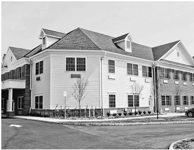
Mt. Bethel Village in Warren opened in January and offers both residential and day programs. The adults special needs community, which offers 24/7 supervision, can accommodate 41 individuals within 38 one and two-bedroom apartments.

social interaction; our 24-7 supervision provides that umbrella of safety and our common areas and diverse roster of group activities promote socialization," Garafola said.