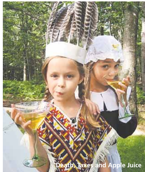
Death, Taxes and Apple Juice