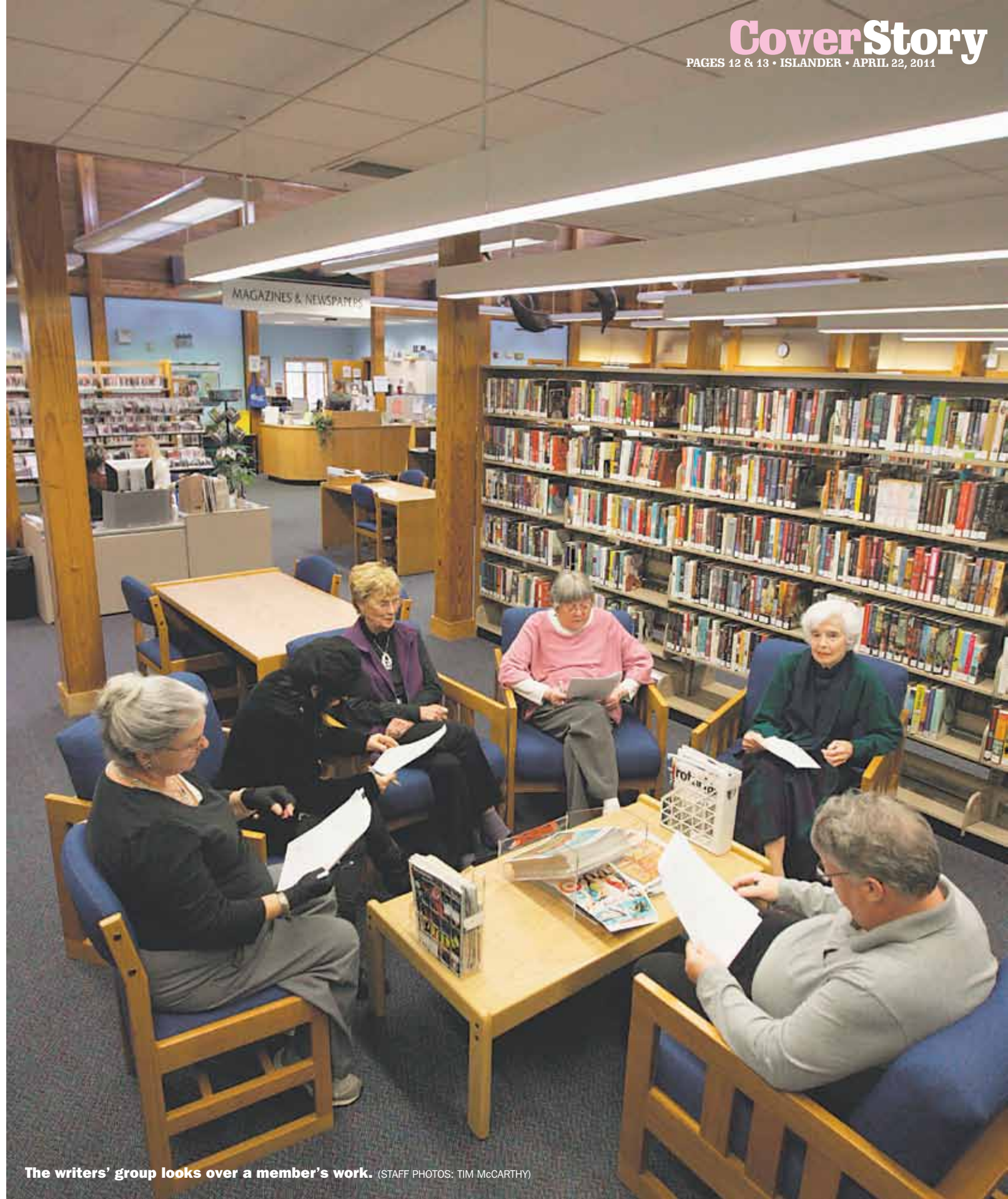
The writers' group looks over a member's work.